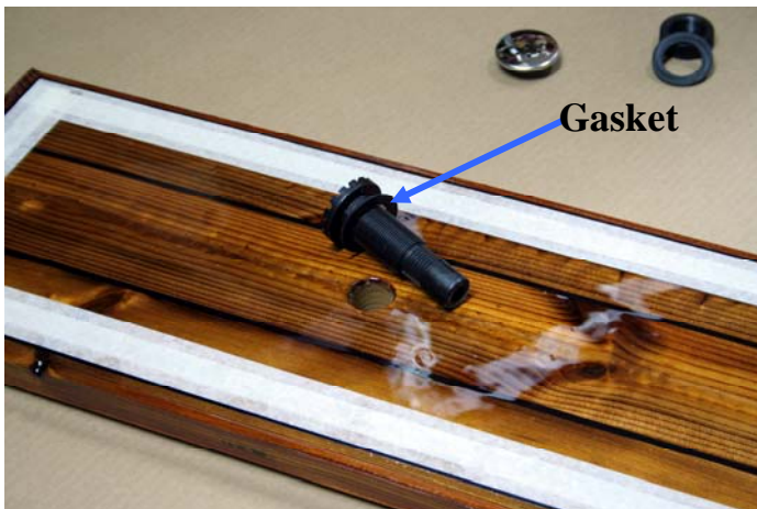
Assemble the air jet. The thinner of the gaskets is placed on the top side.