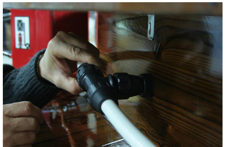
The finished part.