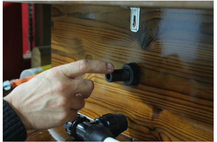
Smear out the silicon