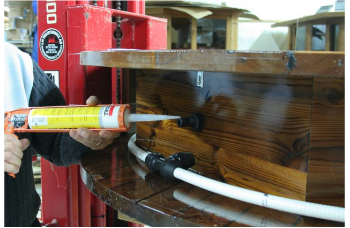
Apply silicon on the airjet