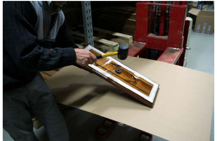
Drive the air jet into the hole using a rubber mallet. Note! Remove gasket before. Hold it from underneath and support the part with your arm. Remove the air jet.