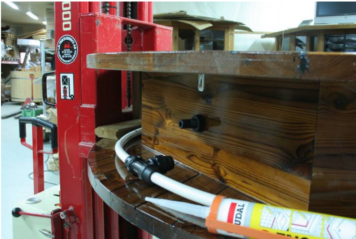
The airjet should be coated with silicon before the T-connection is attached