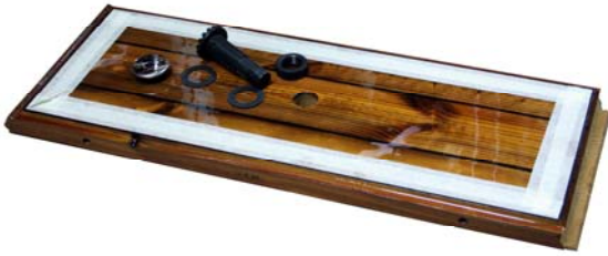
Picture shows parts,