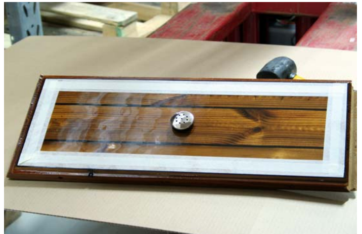
The finished part.