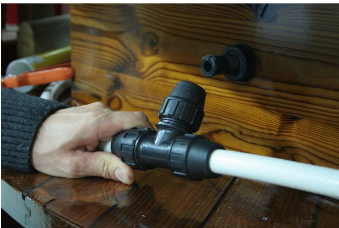
Attach the T-connection